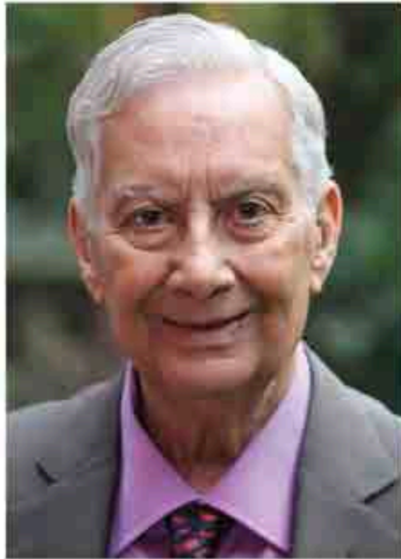
Mr. B.K. Birla - Chairman