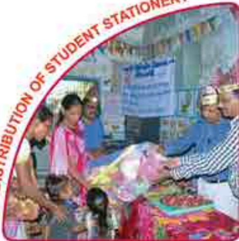
DISTRIBUTION OF STUDENT STATIONERY