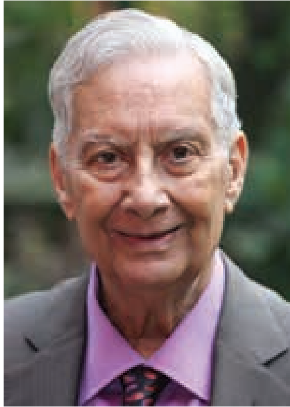
Mr. B.K. Birla - Chairman