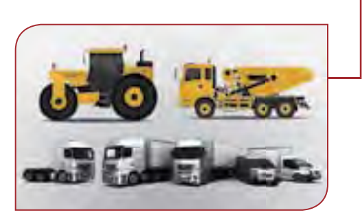
Heavy commercial vehicle: Truck, bus, tractors, 'off the road' OTR vehicles for mining, forestry & earthmover equipment